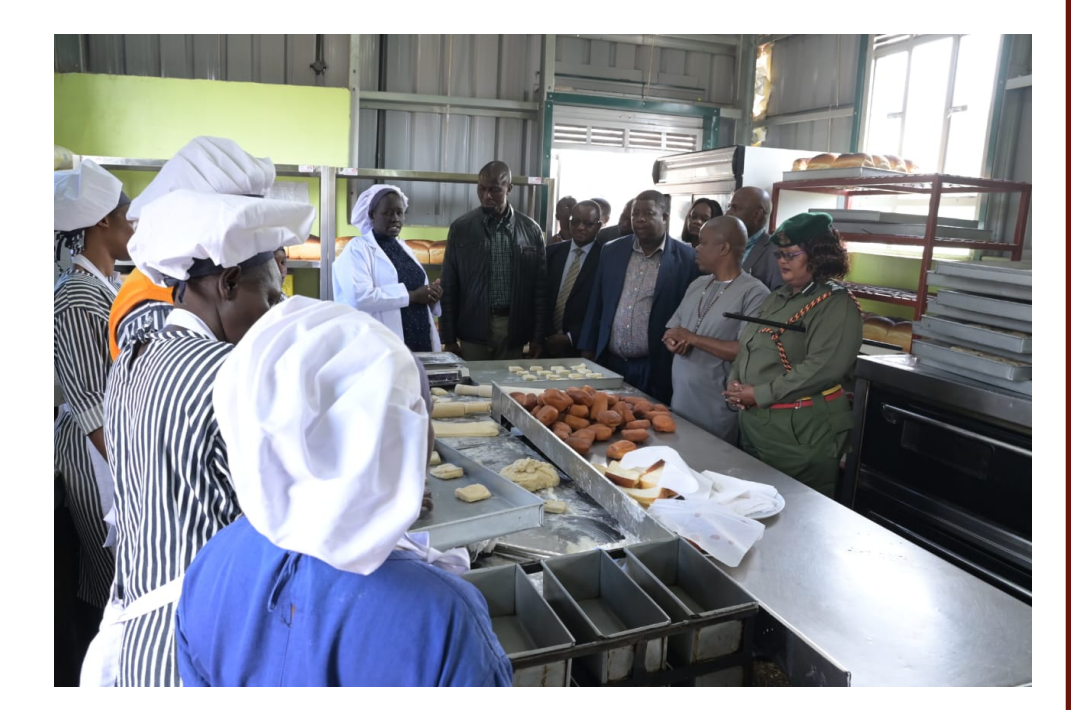
Members of the Zambian Parliamentary Committee on Youth, Sports and Child taken to one of the bakeries during their benchmarking visit

Among other measures, Kenya has established customized day care units , learning sections and dining areas for circumstantial children in specific correction facilities.