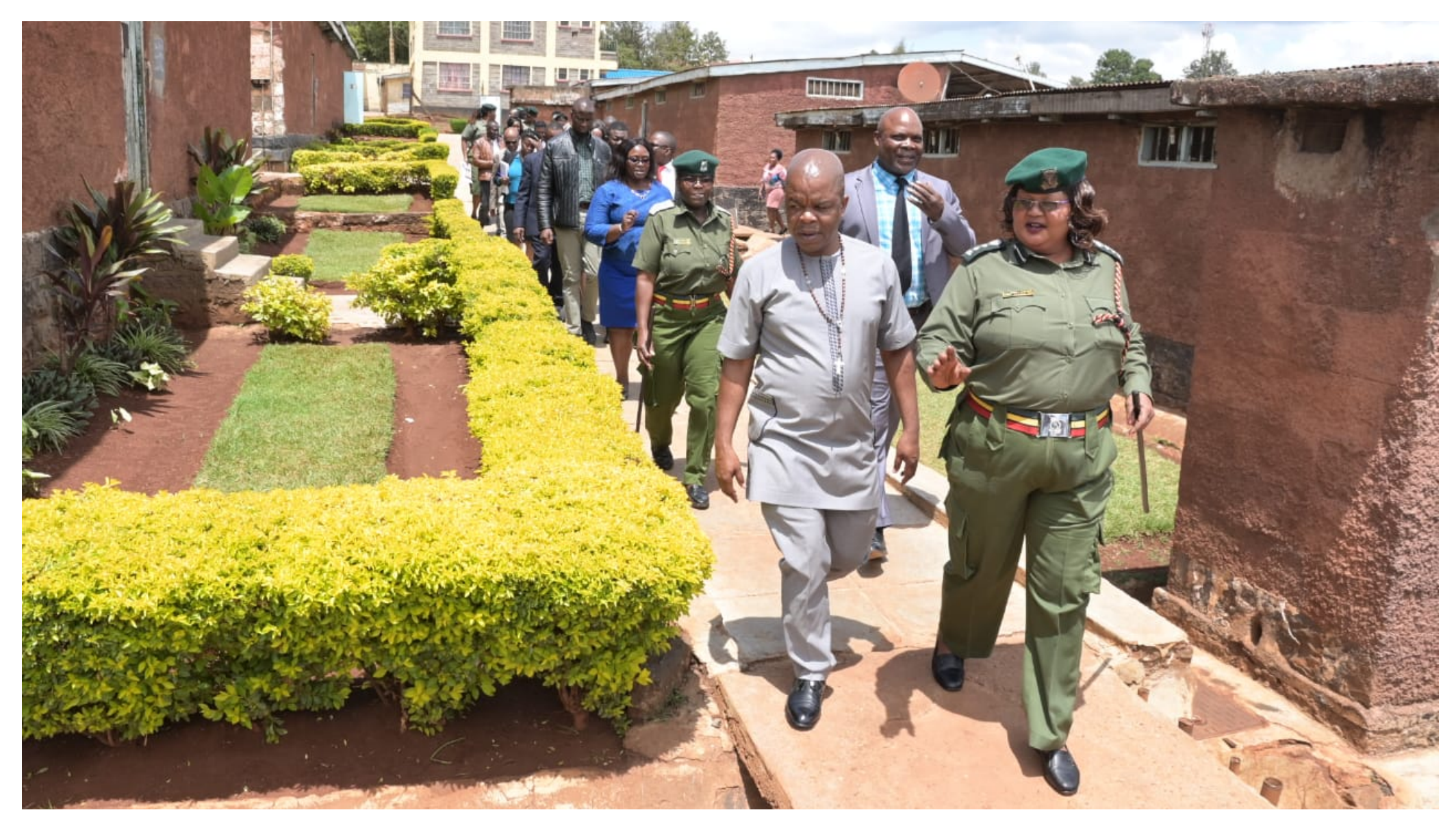
Members of the Zambian Parliamentary Committee on Youth, Sports and Child matters who are in Kenya on a benchmarking visit

embers of the Zambian Parliamentary Committee on Youth, Sports and Child matters arrived in Kenya on a benchmarking visit on the best practises in management of children accompanying their imprisoned mothers.